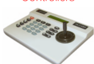
VCL485 Universal Controller